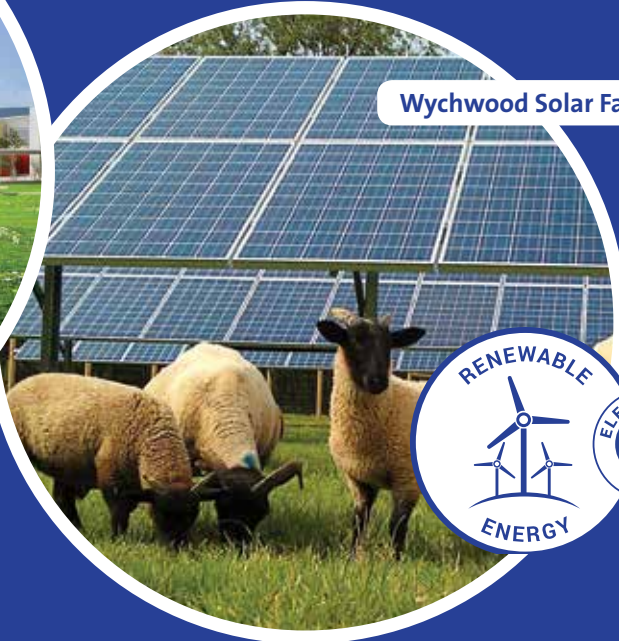
Wychwood Solar Farm