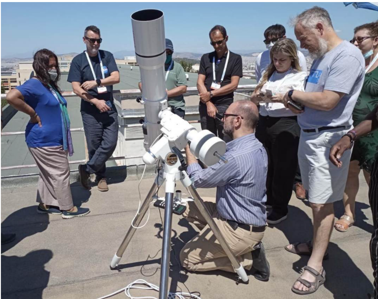
Participants at COSPAR Panel on Education workshop 2022 visit the Athens Observatory.

COSPAR PE aims to develop the means to encourage and spread space-related education. In particular, we work with COSPAR Scientific Commissions and Panel Chairs, or other interested parties, to direct the outreach and education to the appropriate audience, be it a school, university, the general public via the media, or underprivileged students in countries with no space-related activities, for example.\