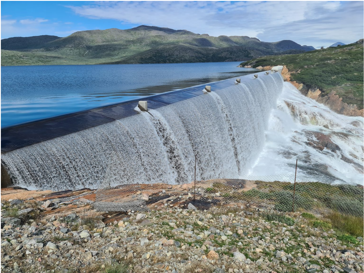
Dam of a small-scale hydropower station of 7MW in the South of Greenland