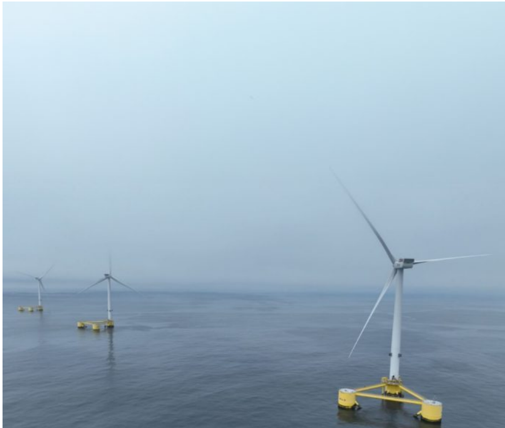
WindFloat Atlantic Project

openaccessgovernment.org/article/sustainable-marine-technologies-and-innovation-tfi-seasprings/172130/