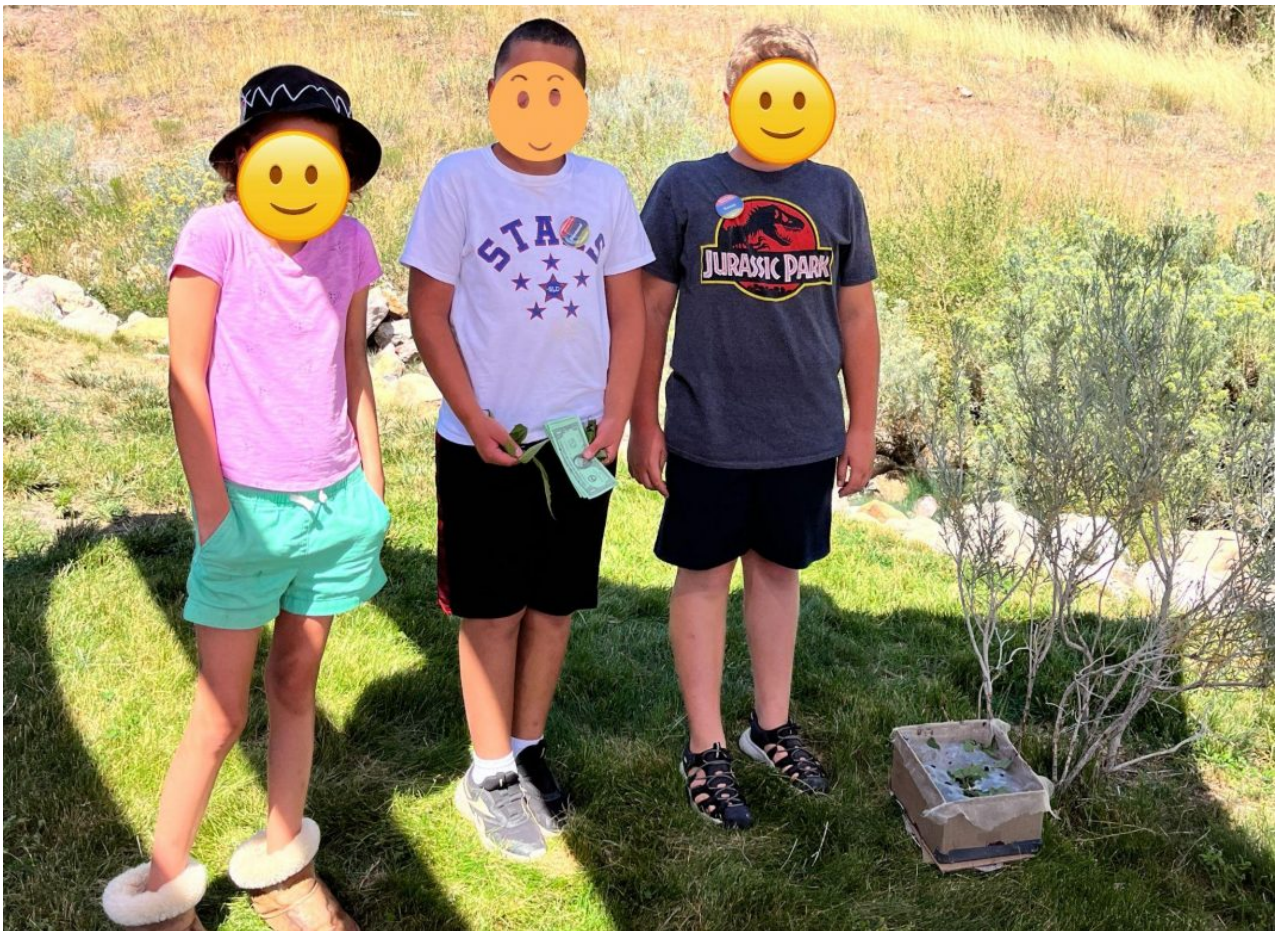
Figure 3c (above): A team placing their insect trap in their chosen location

Our programs follow the ISE instructional model , a learning approach that uniquely interweaves phenomena-based science investigation with engineering design. Results show that students achieve significant learning gains after involvement in our curricular programs (Songer and Ibarrola Recalde, 2021).