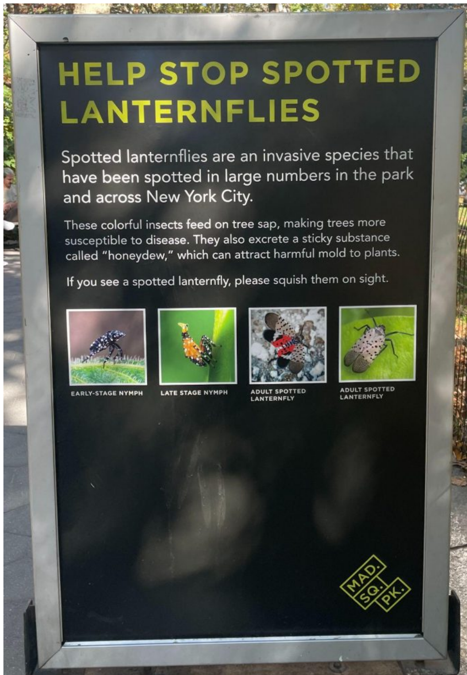
Figure 3a (above): Poster in Central Park, New York, NY, describing harm caused by the Spotted Lanternfly. Figure 3b: A team placing their insect trap in their chosen location.