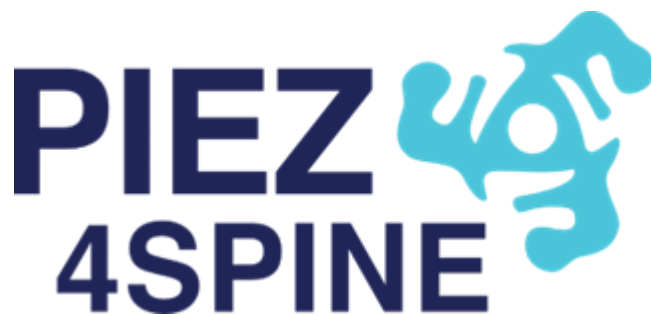
Figure 1. Piezo4Spine logo emphasizing the relevance of Piezo mechanoreceptors to the therapeutics envisioned.

Spinal cord injury (SCI) is a devastating pathology affecting the spinal cord, an essential component of our central nervous system, executing vital instructions, most of which are orchestrated by our brain. According to recent figures from the World Health Organization (WHO), over 15 million people are currently affected by SCI. It is already well-known that the therapeutic window for these patients before the damage and loss of functionality becomes chronic is very limited, often even uncertain.